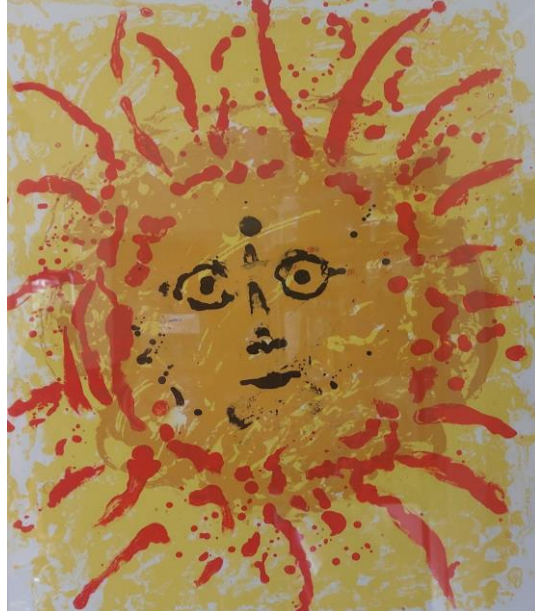
2 – Beautiful head