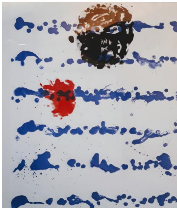
3 – Untitled