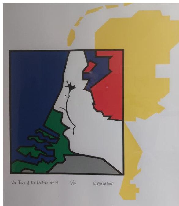
5 – The face of the Netherlands

Recognizable math scenes, often outlined in black. Water, the port of Rotterdam and love, are the themes that attract him the most.