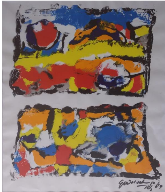
14 – Untitled

He is a graphic artist, painter and designer