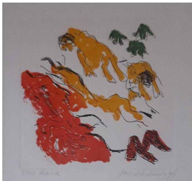
13 – To Rina