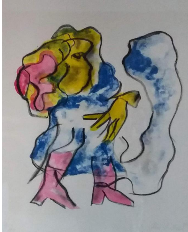
12 – Flamenco

He is especially an expressionist painter, inspired by Cézanne, Matisse, Van Gogh and Picasso, his passion for flamenco has a lot of influence on his work.