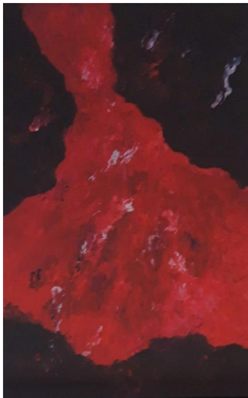
1 – Red cloak

He is one of the most important post-war Dutch artists. His work is based on his personal experience during the Second World War. He addresses existential and universal themes that he describes in terms of power and impotence, perpetrators in victims and memory, in transience and melancholy.