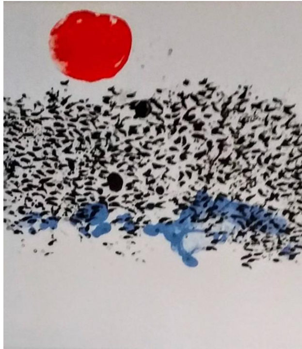
4 – Red sun