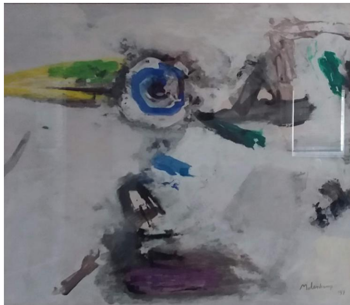
9 – The bird

This artist mainly painted abstract figures of animals and humans inspired by the circus, the theater and fairs.