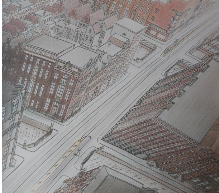
6 – Urban landscape

Architecture regularly features in his work, in earlier versions buildings were viewed from far away, with the regular pattern of windows on the facade of a skyscraper or a group of buildings.