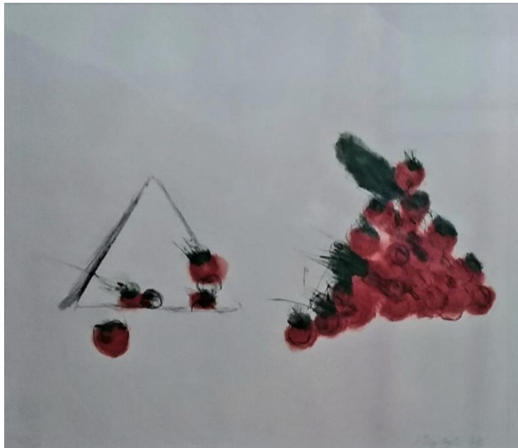
8 – Untitled

Nico Molenkamp (Enschede 1920 - Tilburg 1998)